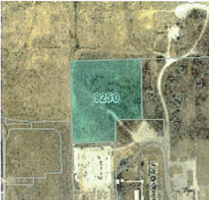
Parcel location within Milwaukee County