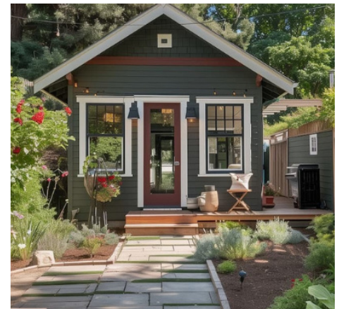
These are examples of Accessory Dwelling Units (ADUs) that have been built around the country. From left to right, these images come from the City of Fairfield, CA, Harbor Gateway North Neighborhood Council of Los Angeles, CA, and Titus Contracting.