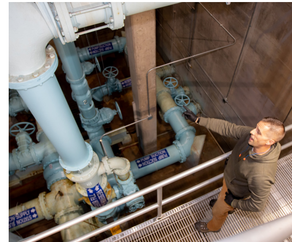
A staff member is within one of the water pumping stations conducting an inspection.

In addition to reporting leaks, residents can also take steps to reduce their own water usage and help conserve resources. Simple measures such as fixing leaks in the home, taking shorter showers, and using water-efficient appliances can make a significant impact.